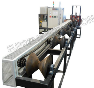
CONVEYOR FOR HEAVY ANGLES MOVING