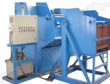
AUTOMATIC BILLET FEEDING SYSTEM