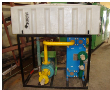
DM WATER SYSTEM