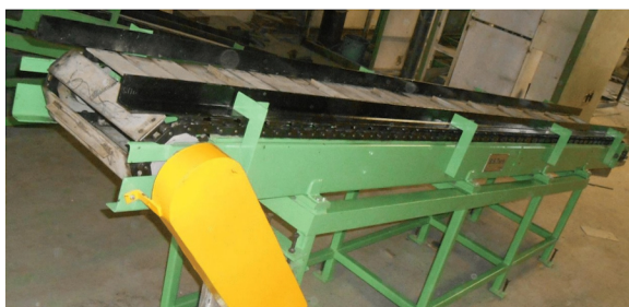
HOT JOB FAST MOVING CONVEYOR