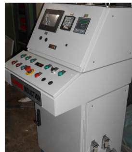
REMOTE CONTROL DESK