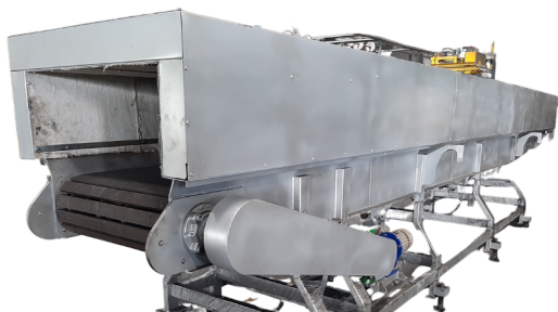
CONTROLLED COOLING CONVEYOR